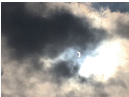
ABOVE: Did you view the recent eclipse? Our students came close, but a cloud obscured the totality. Still, the event had an impact.